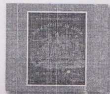
The Campaign in India by Captain G.F. Atkinson

A reprint from the library collection of the National Archives of India, this book illustrates the progress, rather than the process, leading to the siege of Delhi and its recapture.